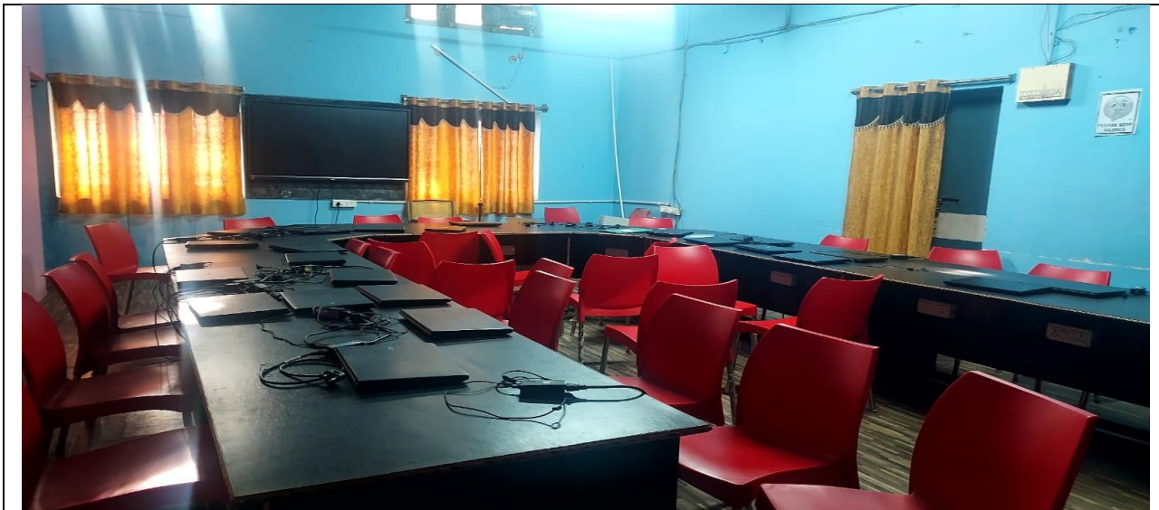
Ladies Reading Rooms and Skill Development Centre