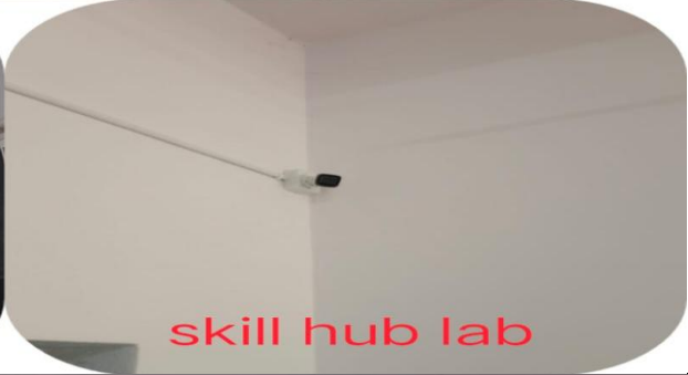
skill hub lab