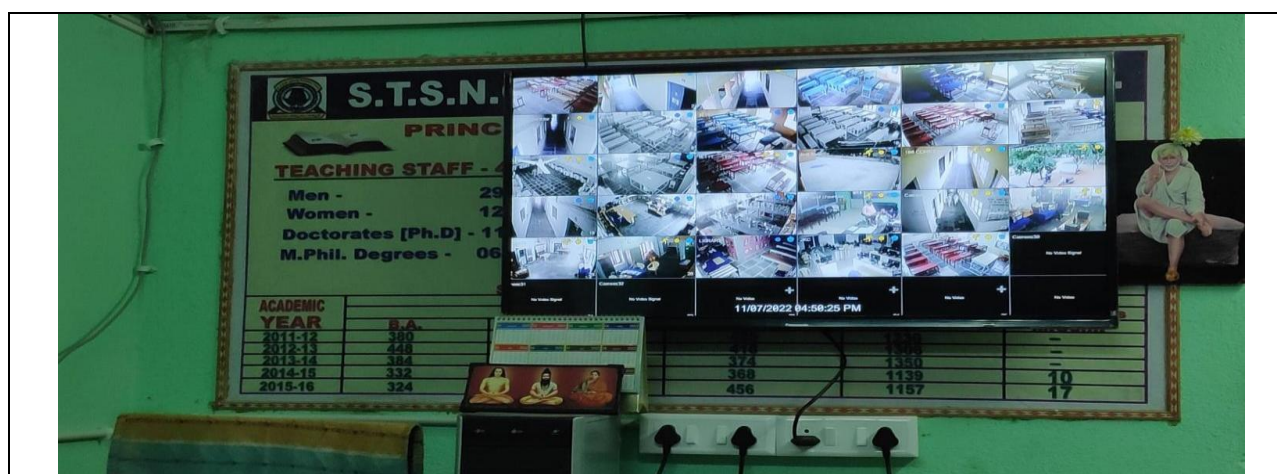
Central Security Monitoring Panel in the Principal's Chambers

Specific facilities provided for women in terms of: a. Safety and security b. Counseling c. Common Rooms d. Day care center for young children e. Any other relevant information.