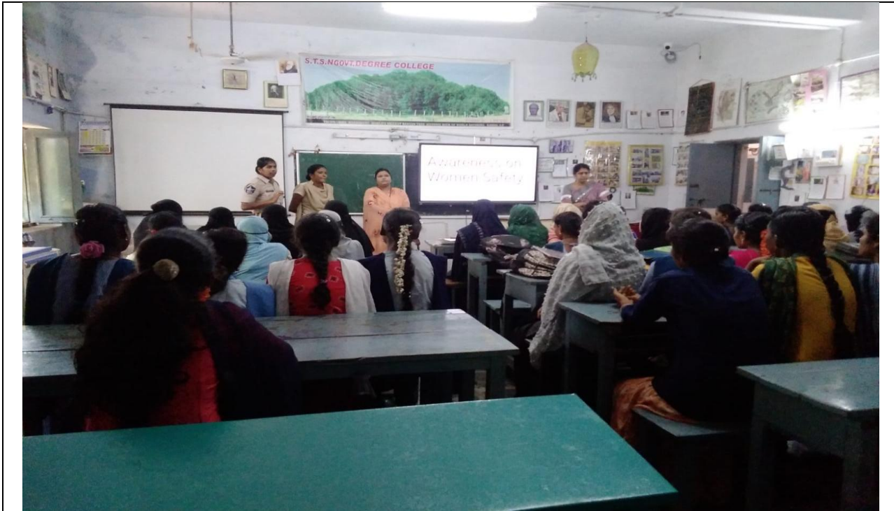
KADIRI TOWN DISHA POLICE UNIT COUNSELLING WOMEN STUDENTS AND EXPLAINING THE IMPORTANCE OF DISHA APP FOR GIRL STUDENTS

PRINCIPAL STSN GOVERNMENT DEGREE COLLEGE KADIRI-515 591