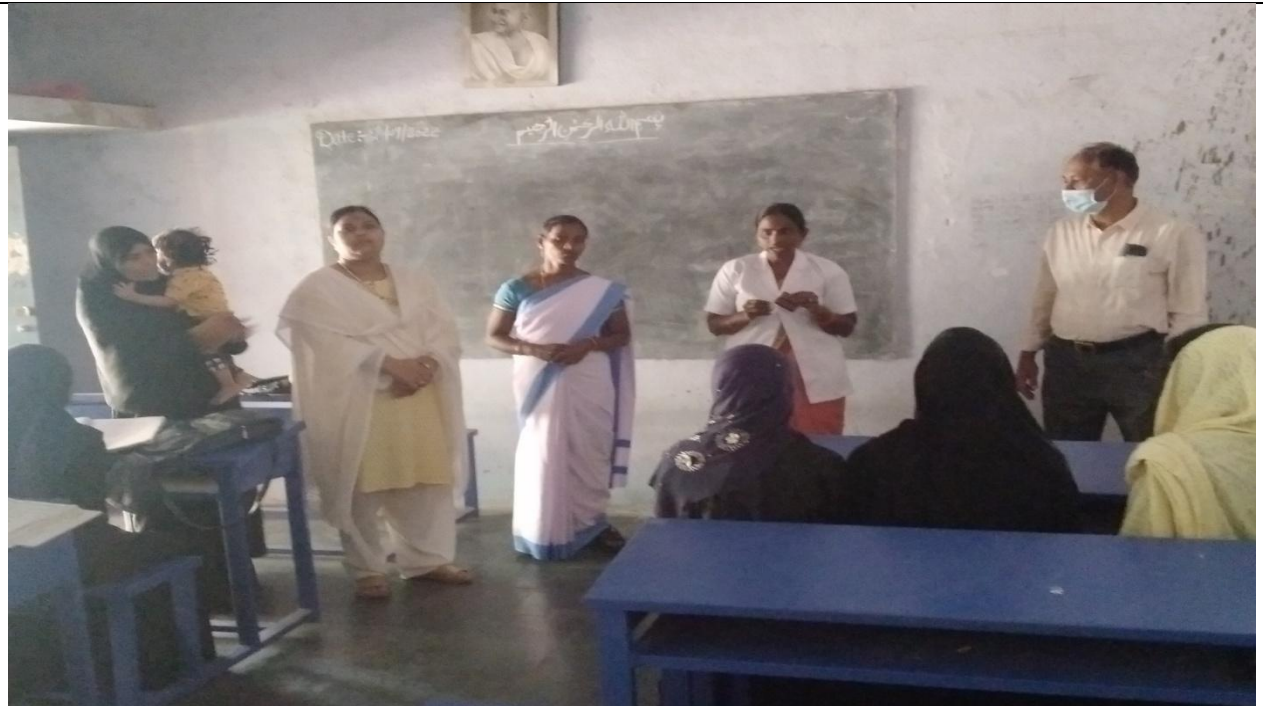
THE PARAMEDICS FROM KADIRI AREA HOSPITAL INTERACTING WITH THE GIRL STUDENTS ON THEIR PERSONAL HEALTH AND HYGIENE