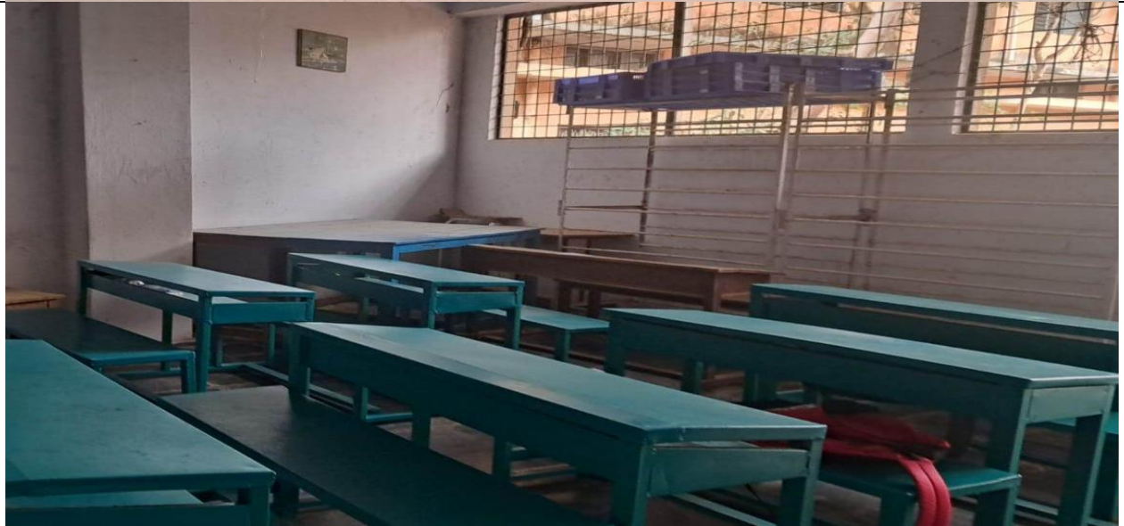
Ladies Waiting Room